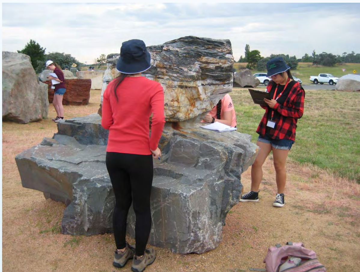
EESO students study quartz veins from the Victorian Goldfields.