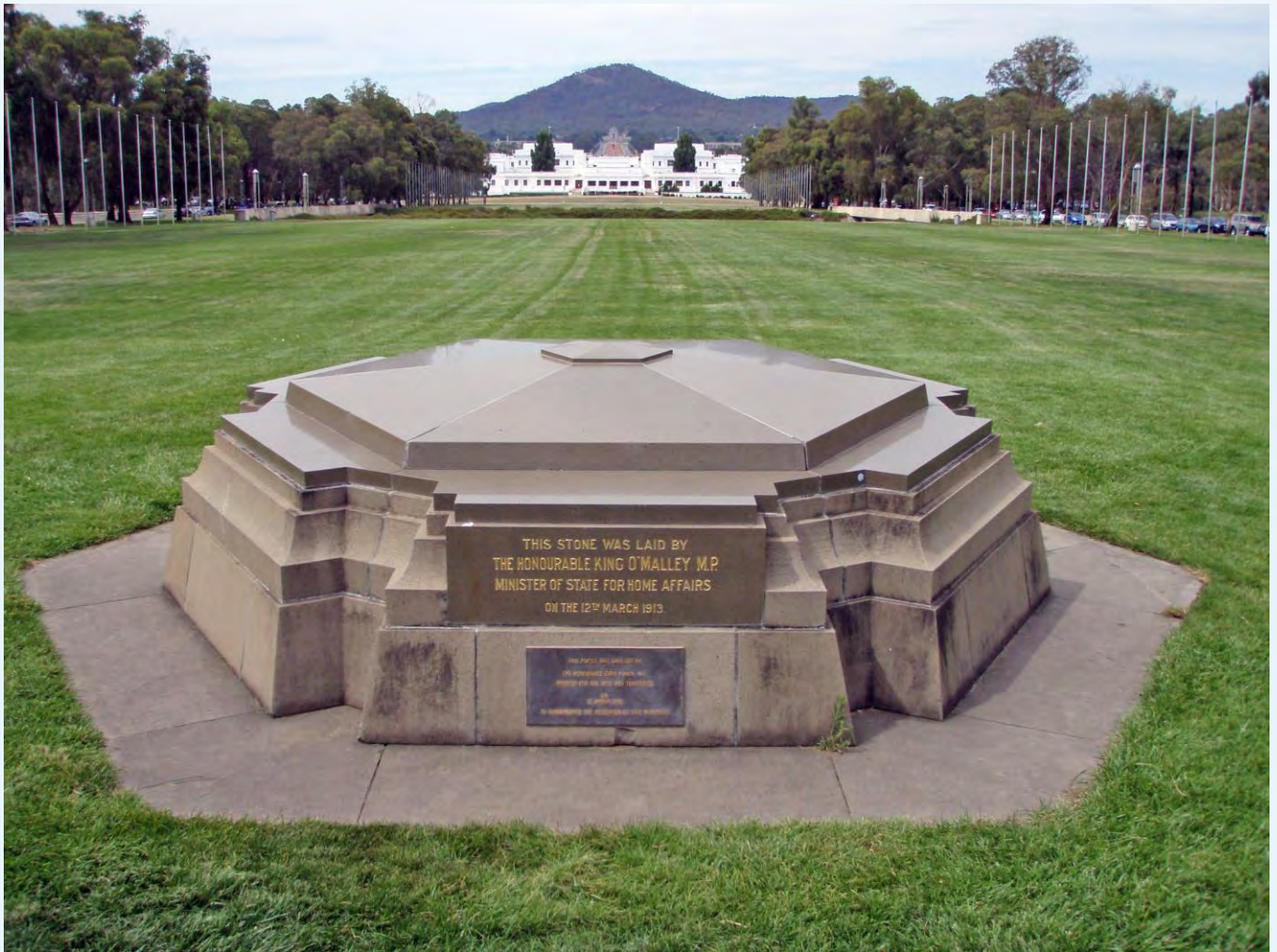
Canberra foundation stone, laid in 1913, with a view behind to old Parliament House.

Bowral Trachyte is the commercial name given to the rock which was quarried at Mount Gibraltar, and used extensively as a decorative building stone in Sydney and the Southern Highlands of NSW, for the Canberra foundation stone and for Australia House in London.