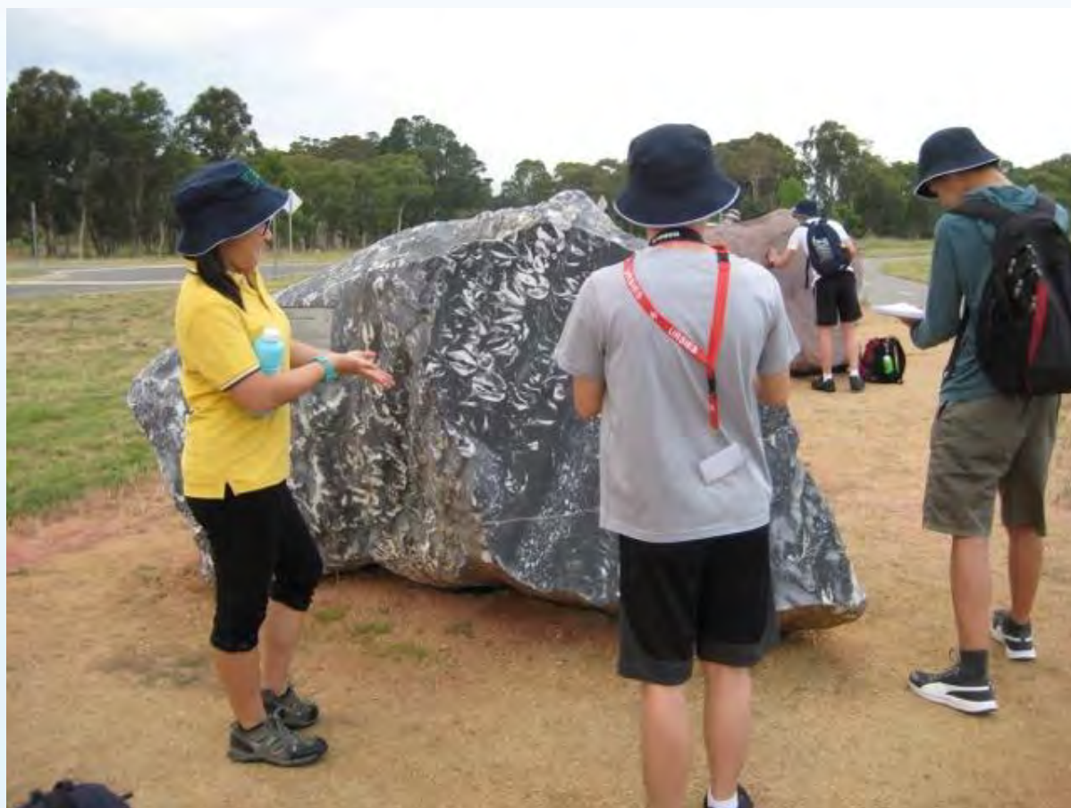
Abundant marine fossils in the Chinaman Creek Limestone from Queensland attract the EESO students.