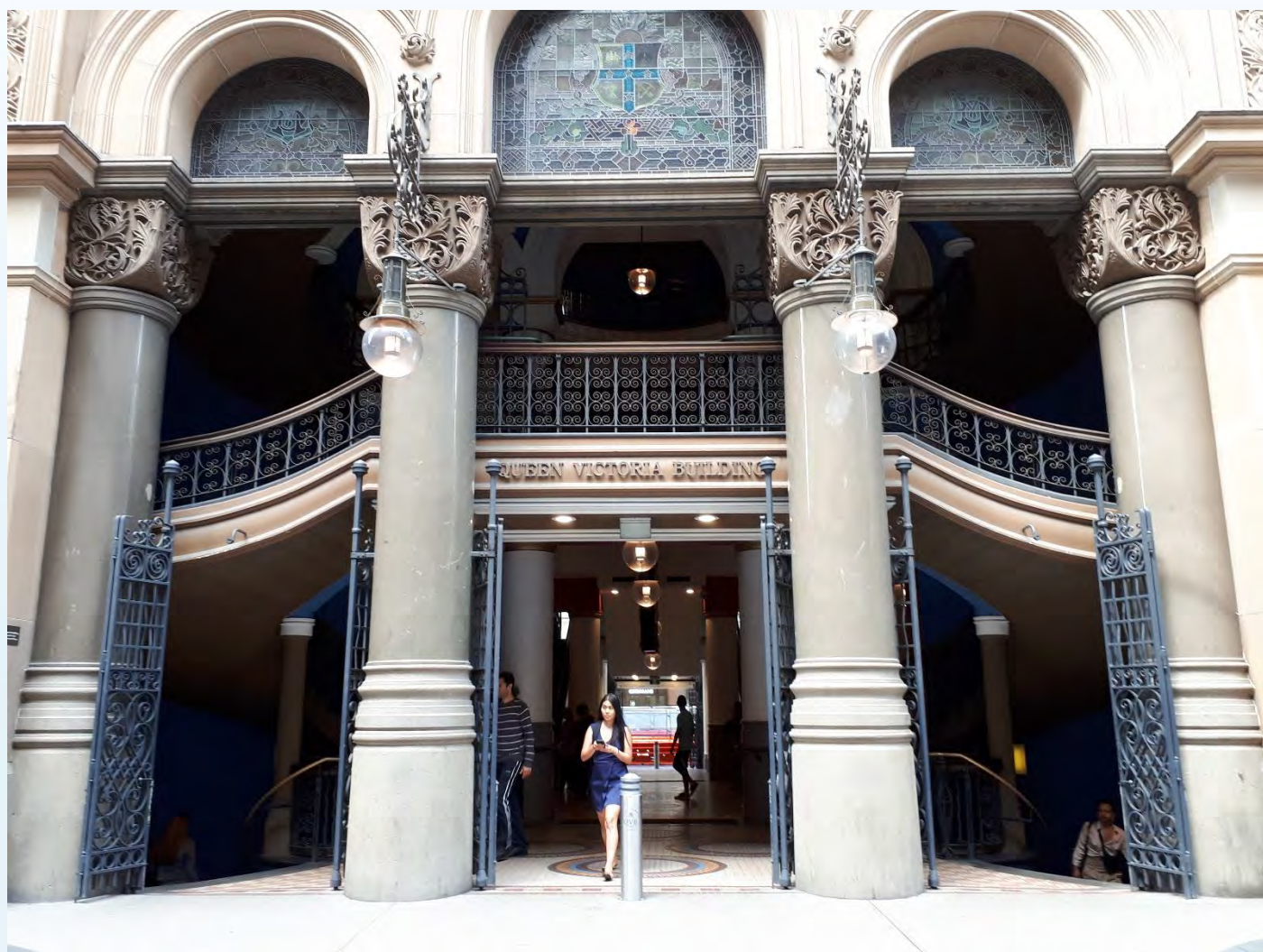
Polished columns of Bowral Trachyte at the western entrance to the Queen Victoria Building in Sydney. There are 75 columns of Bowral Trachyte which support rows of arches around the building. See www.visitsydneyaustralia.com.au/queen-vic-bldg.html .

In November 2017, Rodney South of KraneworX Crane & Truck Hire in Moss Vale brought his crane truck into the Council-owned Mount Gibraltar Reserve, and commenced moving 2 large rocks. The first specimen of about 10 tonnes was relocated approximately 15 metres from the quarry floor to the site of a new wall planned for construction by Mount Gibraltar Landcare and Bushcare Volunteers. The second specimen of around 11 tonnes was carefully manoeuvred onto the crane truck for transportation to Canberra, where Brad Pillans was on hand to supervise its unloading.