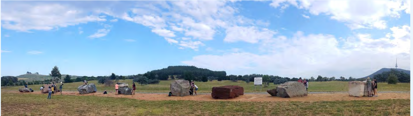
Panorama of Summer School students inspecting the Federation Rocks.

The Earth and Environmental Science Olympiad (EESO) Summer School has based its operations on the ANU campus at the Research School of Earth Science (RSES) since its inaugural year in 2015 and has visited the National Rock Garden each year as part of the field trip component of the Summer School.