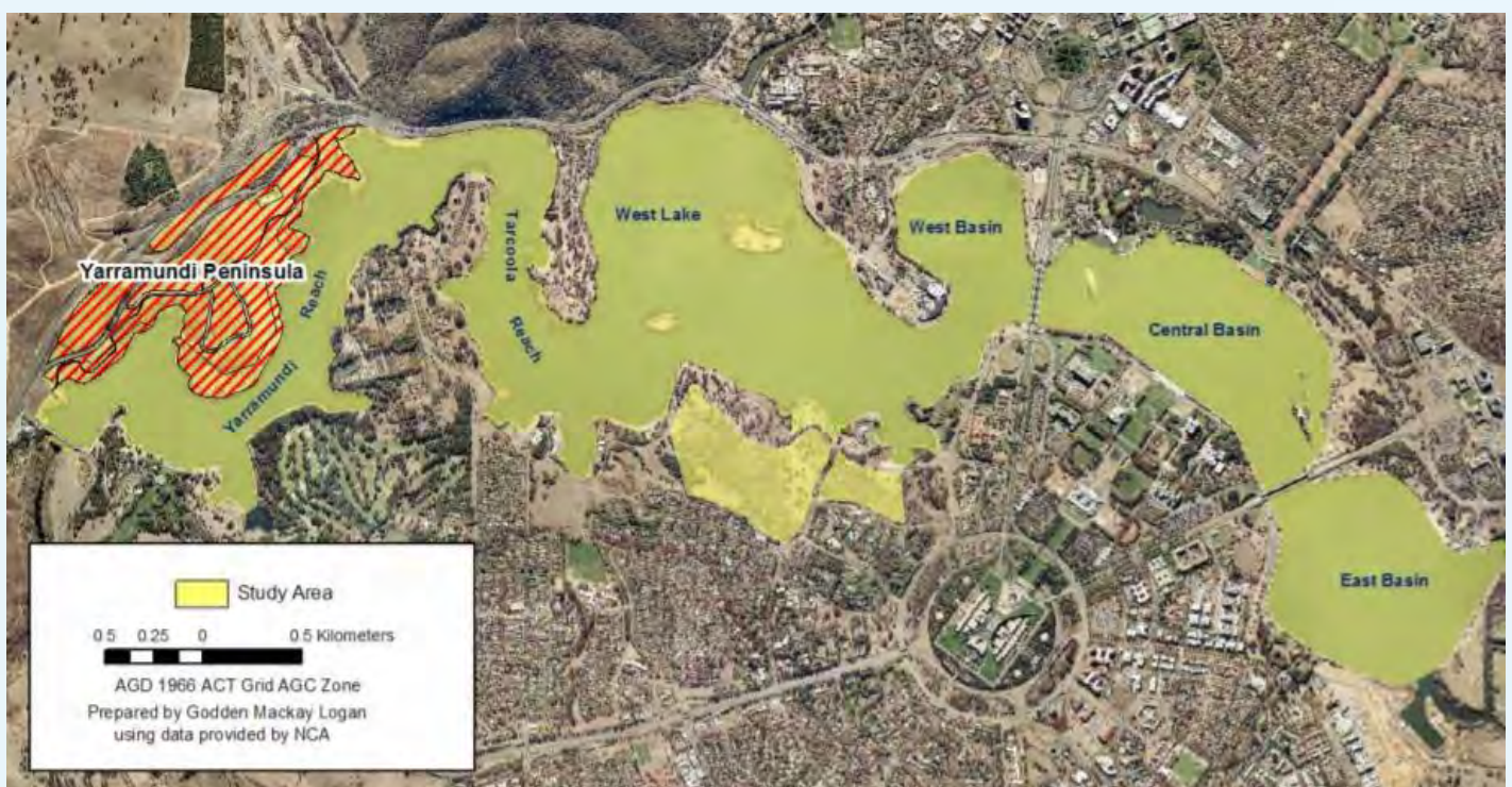
Location map with Yarramundi Peninsula shown in red cross-hatching, adjacent to Lake Burley Griffin shown in green. Figure from Godden Mackay Logan, 2008

The land which was gazetted for the location of the National Rock Garden occurs within the Yarramundi Peninsula Precinct of the foreshore region of Lake Burley Griffin. Yarramundi Peninsula (see map below) is managed by the National Capital Authority (NCA) which is responsible for ensuring the full range of functions (to maintain, enhance and promote the national qualities of the National Capital) are performed for the Commonwealth on behalf of the Australian people (NCA 2017). The Authority's role of fostering awareness of Canberra as the National Capital is also developing as a major focus for the future, with the goal to build the National Capital in the hearts of all Australians. The NCA seeks to do this by creating an enduring capital which is relevant to all Australians and which is recognised as a place for important events and ceremonies.