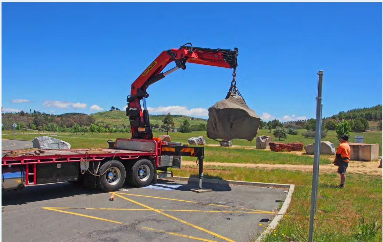
The Mount Gibraltar specimen is delivered to the NRG site in Canberra.