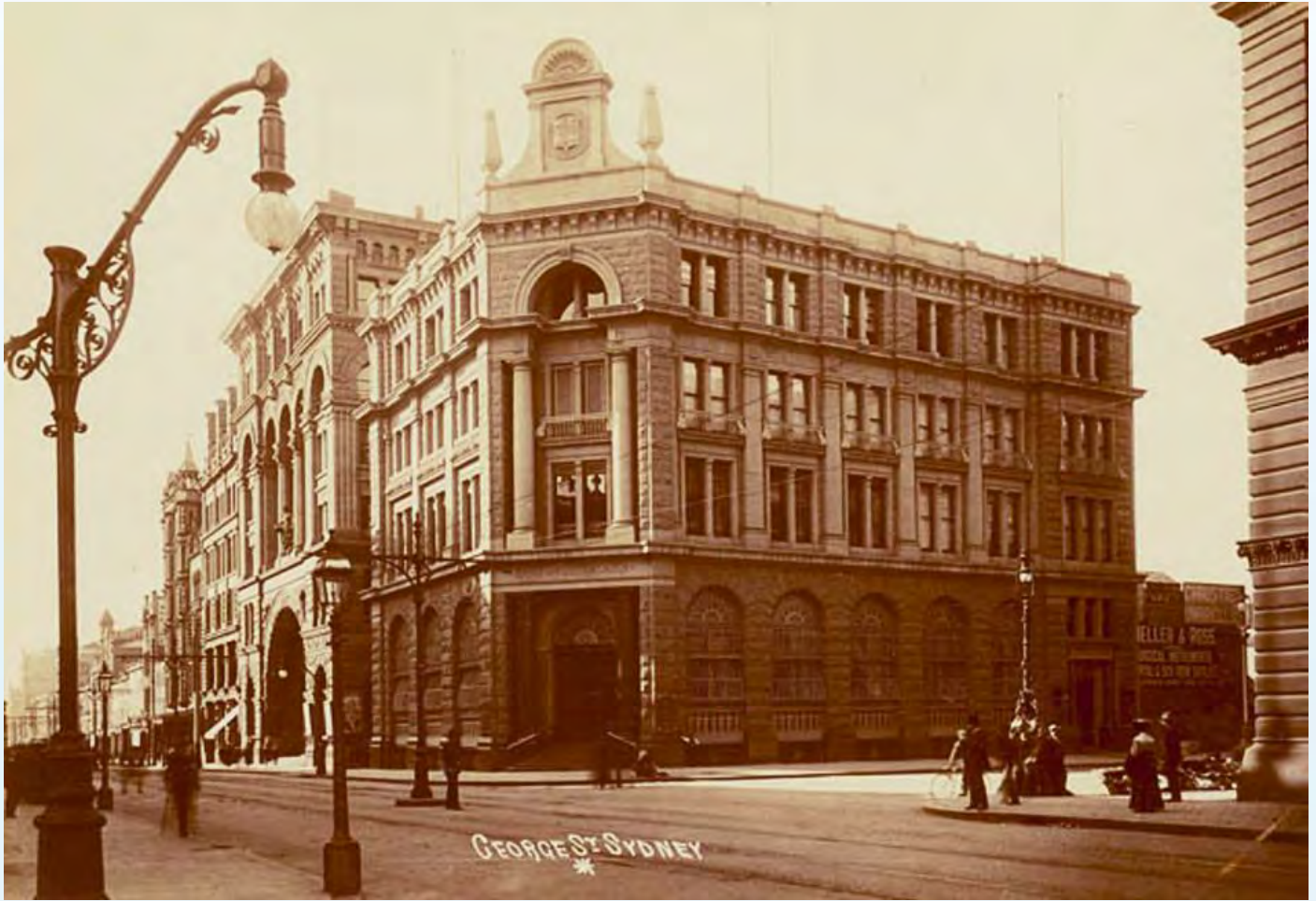
Société Générale House on the corner of George Street and Martin Plaza in Sydney, built using Bowral trachyte, on completion in 1895. This beautiful building can be visited today, but is difficult to photograph due to the current light rail installation along George Street.