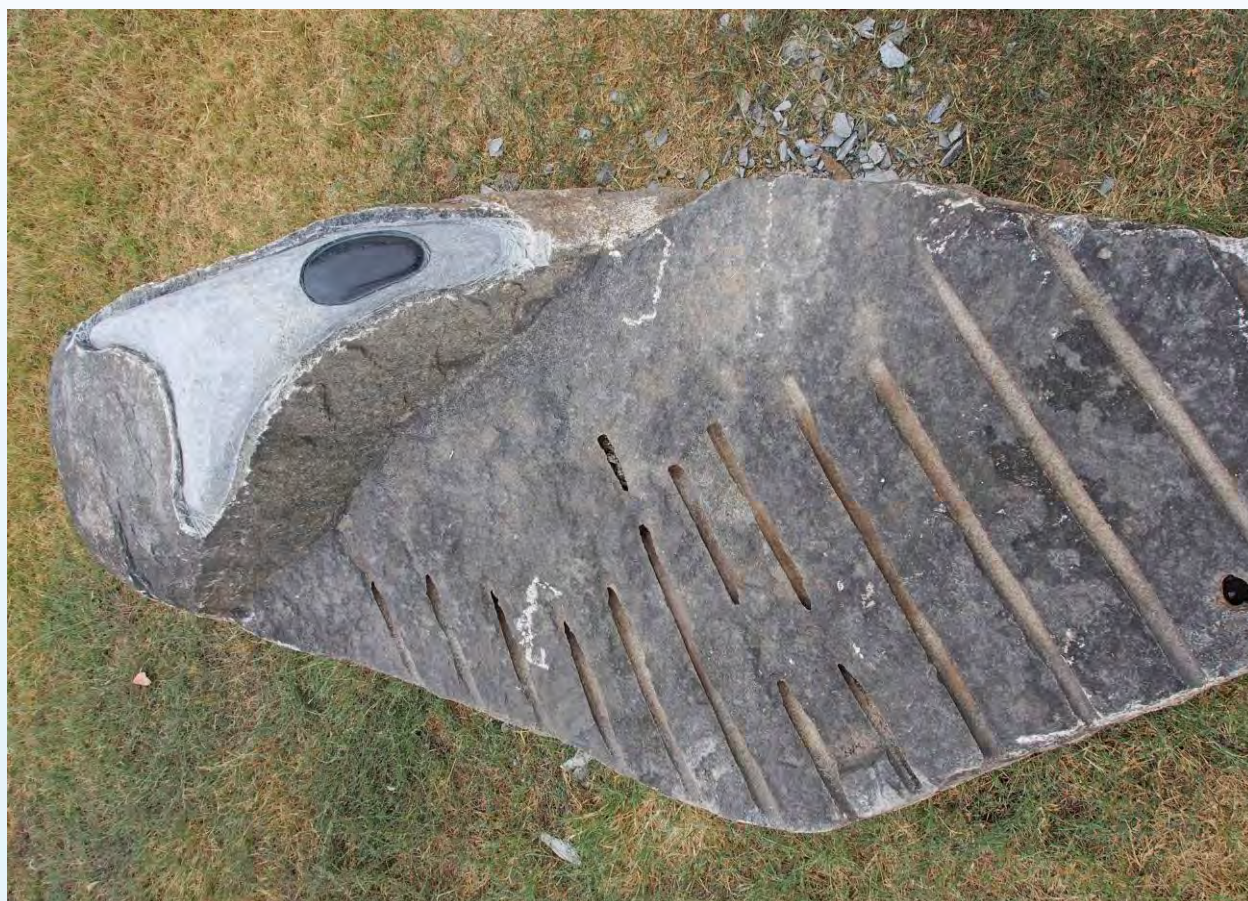
Adelong Norite specimen for the NRG, viewed from above. The parallel series of drill holes were drilled to split the rock when it was quarried.